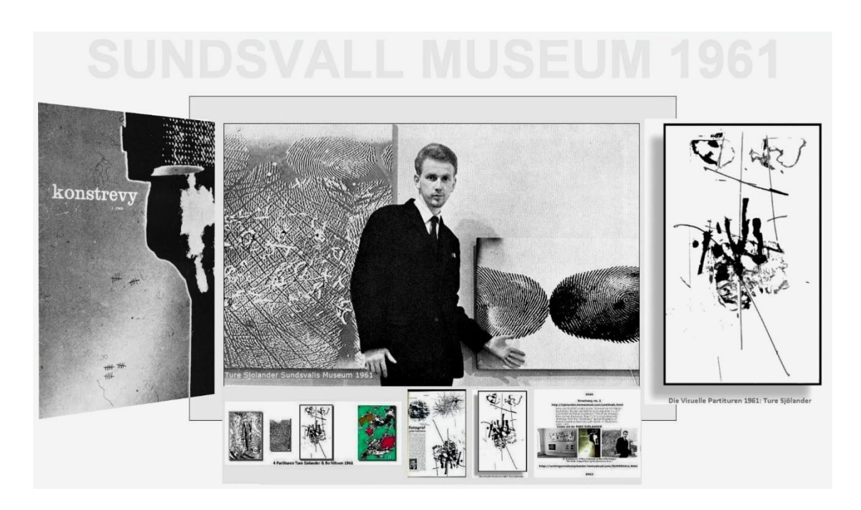
Ture Sjölander Sweden 1961